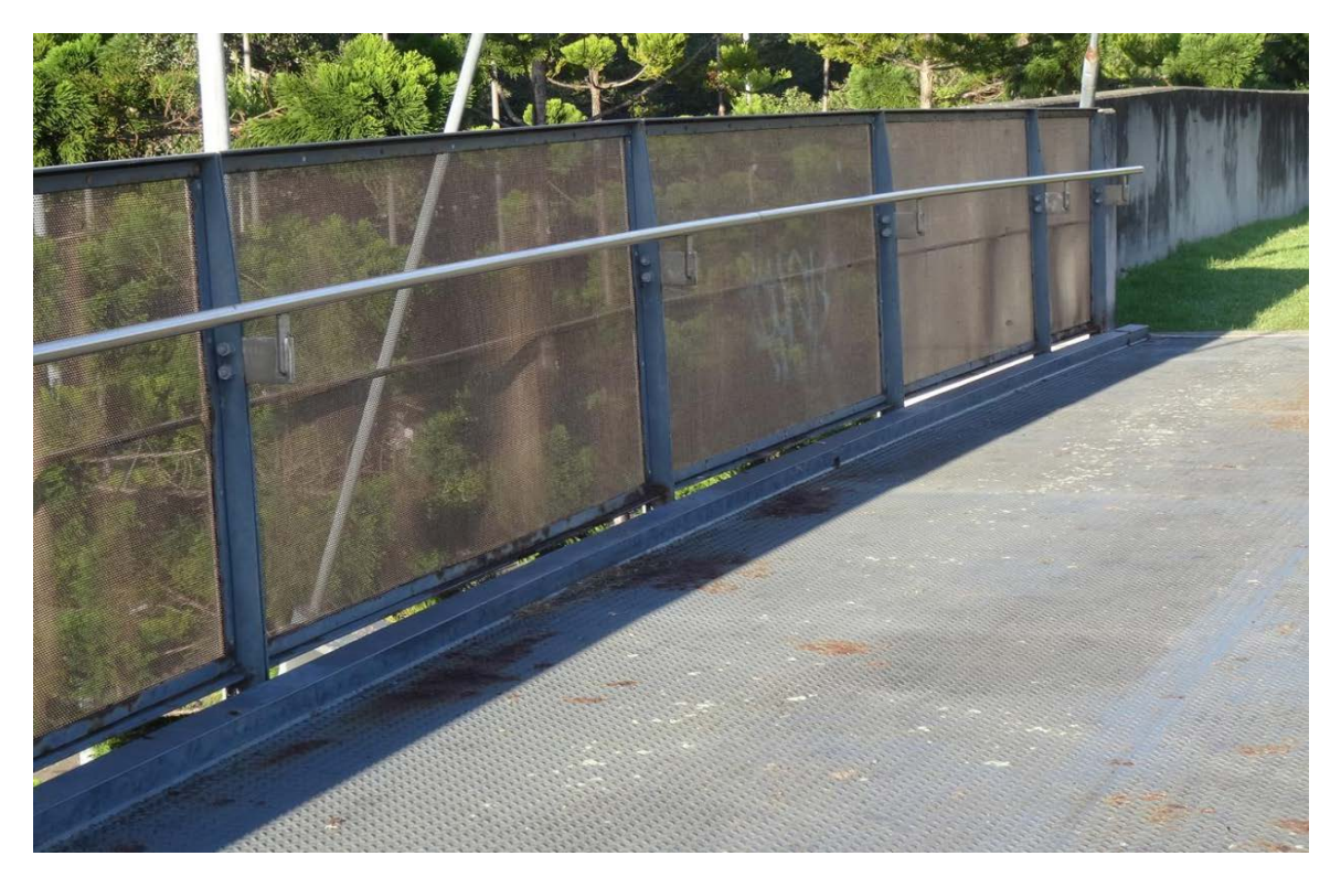
Fence to be removed, repainted and reinstalled