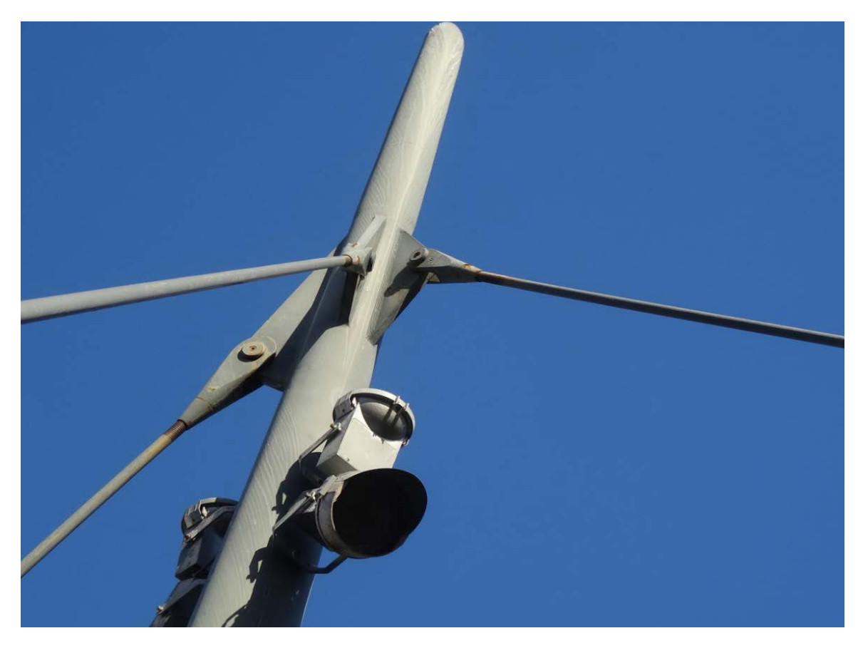
Mast and steel support tendons to be cleaned and repainted